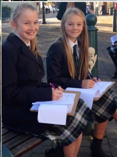
7W collecting their data

Year 7 girls were out and about in Sleaford recently gathering primary data as part of their Geography lessons. The girls went out in their lesson accompanied by their teacher and thoroughly enjoyed their first taste of ‘data collection’. The first Geography trip of many hopefully! They were examining the impact of traffic in Sleaford, as well as questioning members of the public about their shopping habits in order to assess the facilities and services that Sleaford has to offer. The girls also completed Environmental Quality Surveys and evaluated the quality of the built environment. Some of the groups had designed their own questionnaire questions during their previous lessons. Fieldwork is an important aspect of any Geography learning and the girls were very excited and engaged in learning outside the classroom. They behaved impeccably and were a credit to the school in their attitude and approach to the task. They will now be producing a short report in their follow up lessons about Sleaford and its amenities.