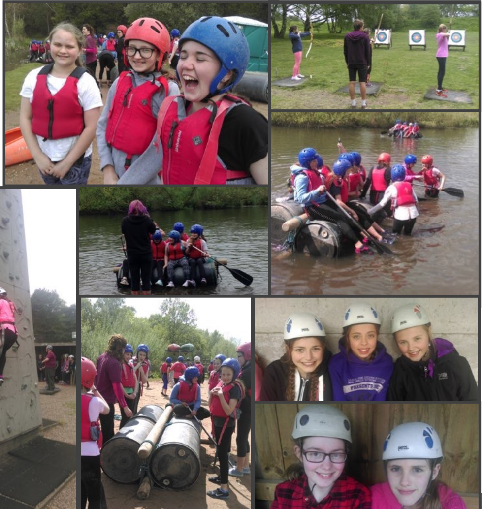
Year 7 Walesby Forest Trip