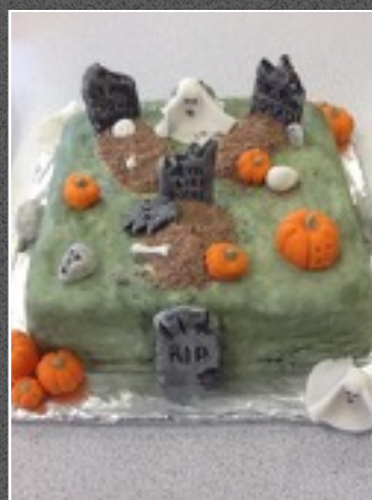
Teigan Kinnon 8F