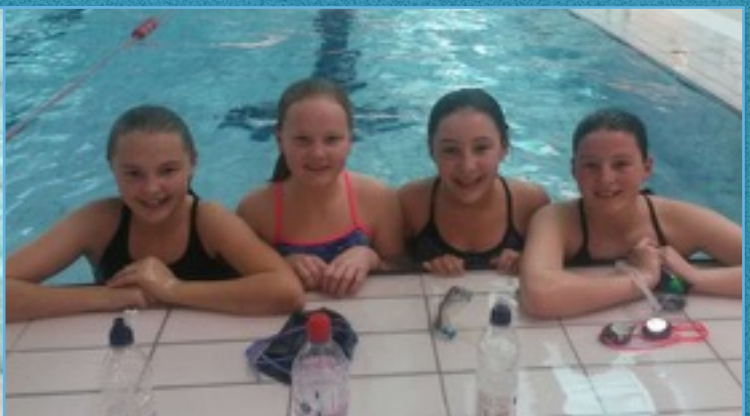
Year 7 & 8 Team