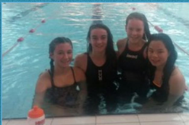
Year 9 to 11 Team

We are extremely proud of our swimming team who came together and through their effort and commitment were able to represent Kesteven and Sleaford High School once again to achieve high quality results.