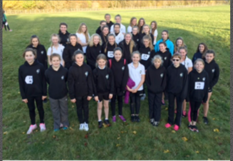
Kesteven and Sleaford High School Cross Country Team