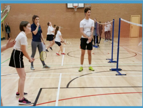
Year 13 Sports Leaders Sports Festival