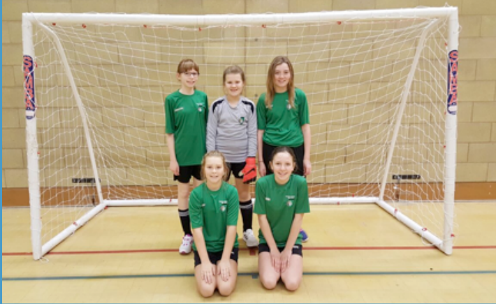
Year 7 Futsal Team – Won the Year 7 Kesteven Schools Girls' Futsal tournament