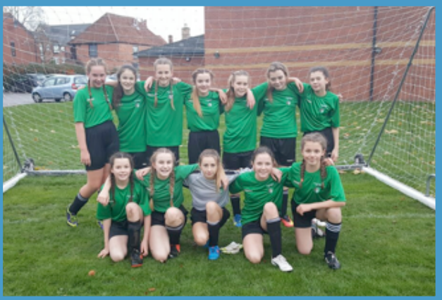
Under 13 Football Team Beat Spalding High School 9-0