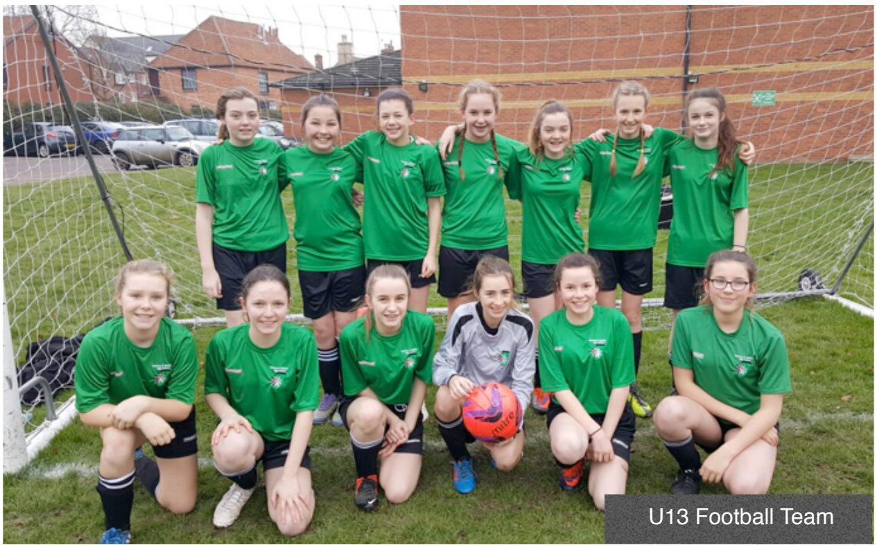
U13 Football Team