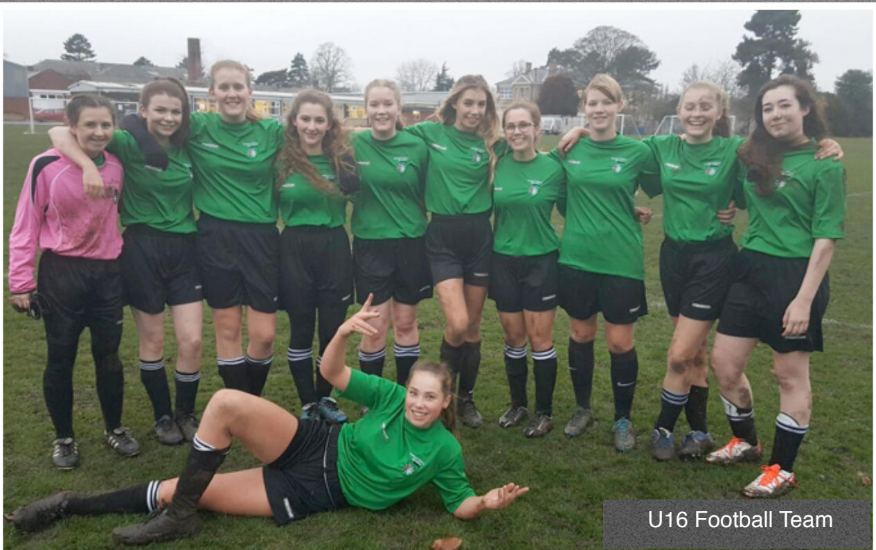
U16 Football Team