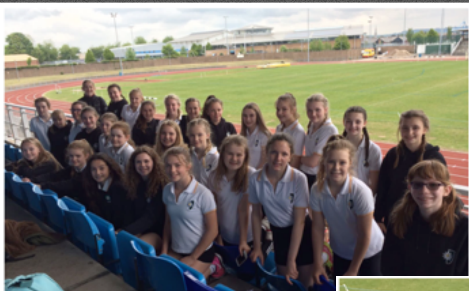
Year 7 and Junior Girls' Athletics Teams