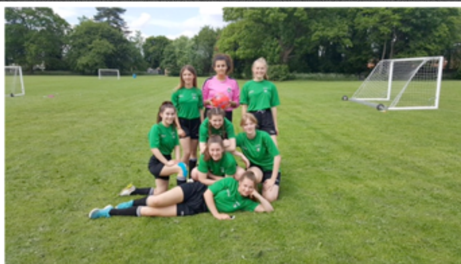
U15 7 a side Football Team