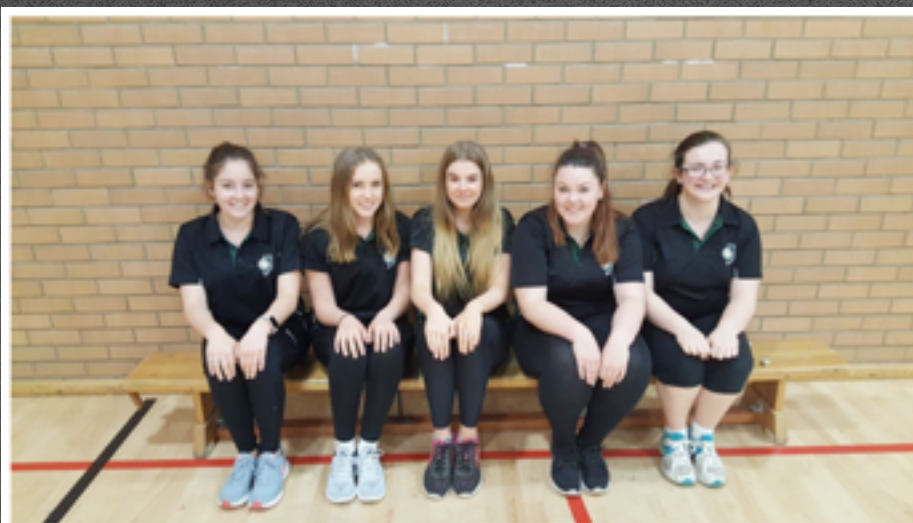
Year 10 Sports Leaders