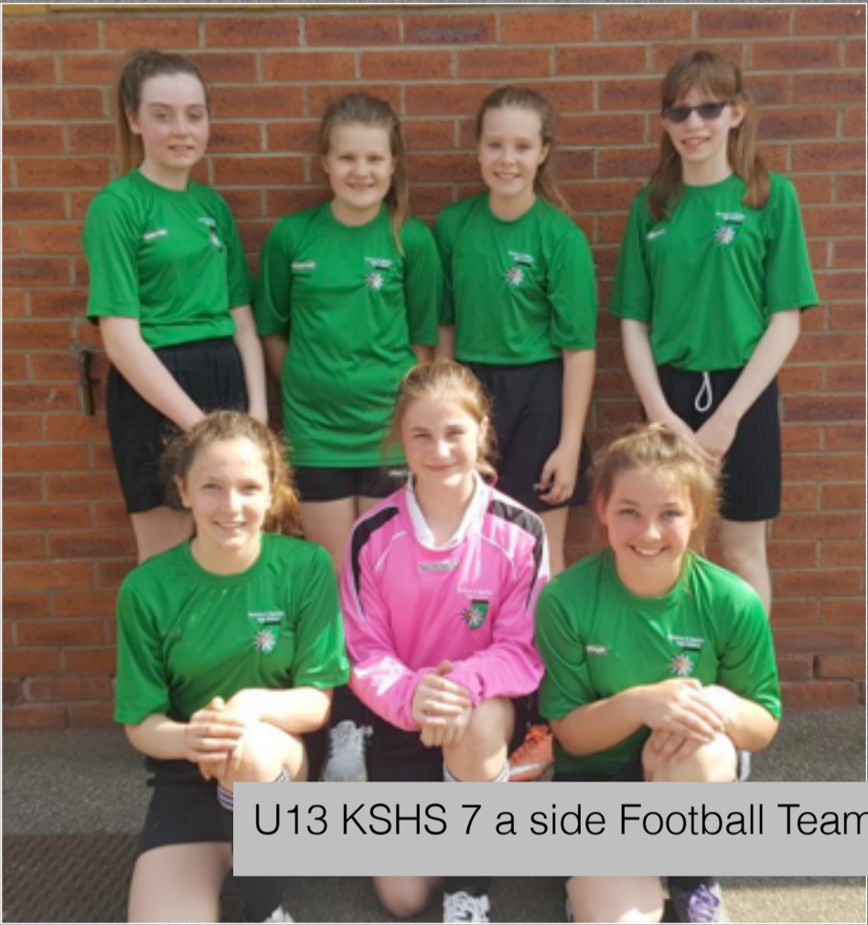
U13 KSHS 7 a side Football Team B