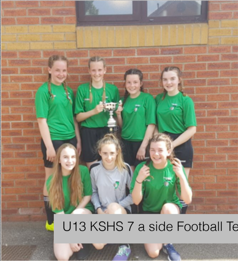
U13 KSHS 7 a side Football Team A

The U12 KSHS Futsal team will be playing in the FA Youth East Midlands Futsal Finals in Nottinghamshire on Saturday 17 th June. We wish them the best of luck!