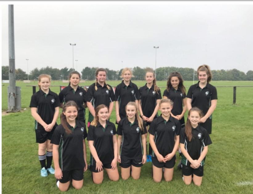
Rugby Development Day Squad