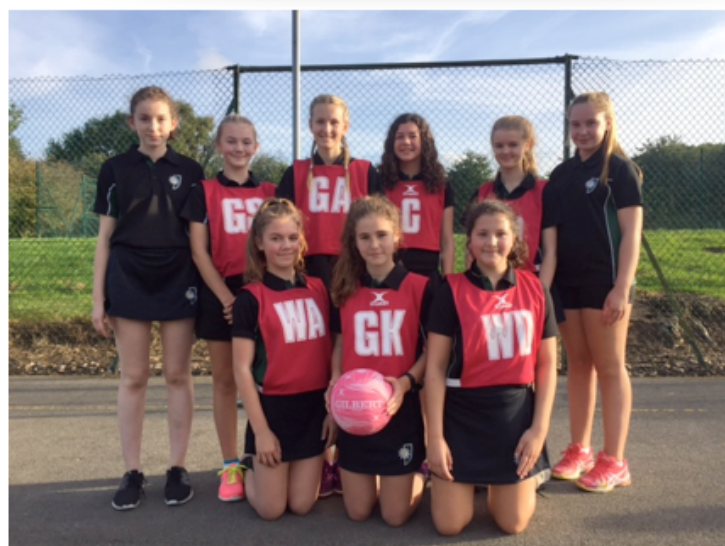
Year 9 Netball Team