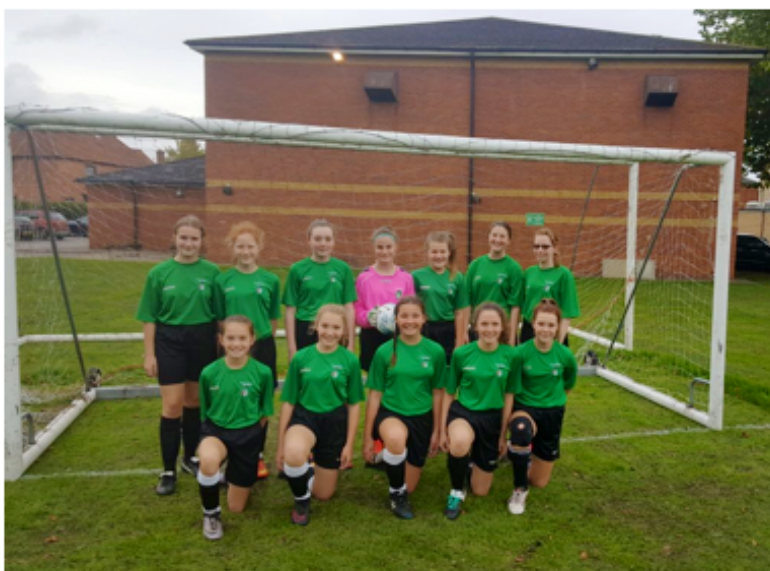
Under 13 Football Team

The Netball season continues. The Year 8 and 9 teams have started the season well with wins against Walton Girls School. The Year 10 and 11 teams have continued to play well and achieve some good results.