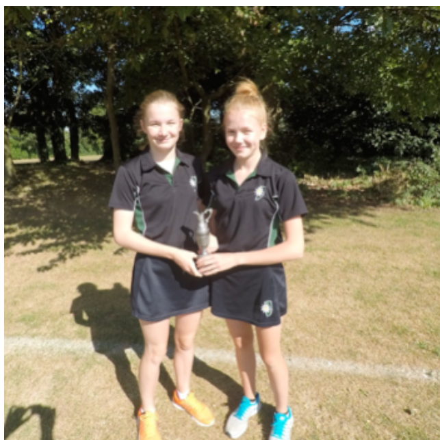
Bailey Trophy Winners