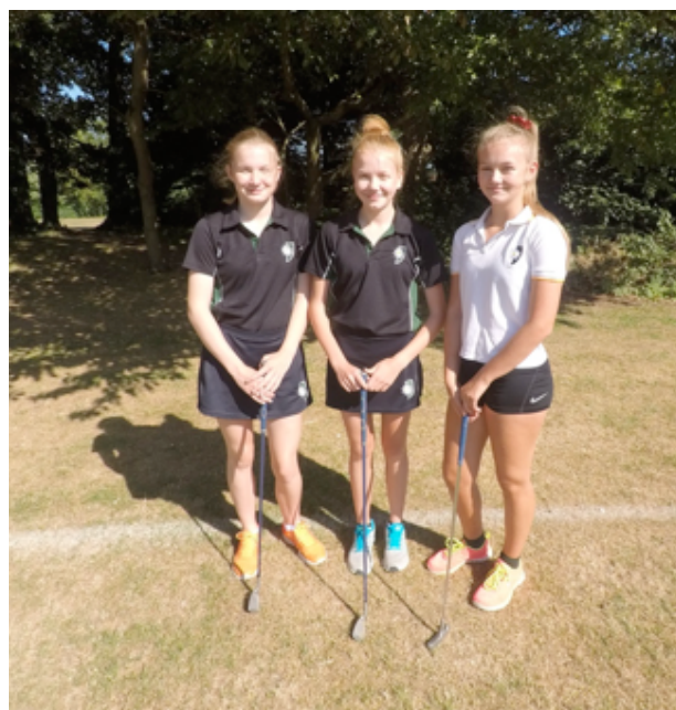
KSHS Golf team