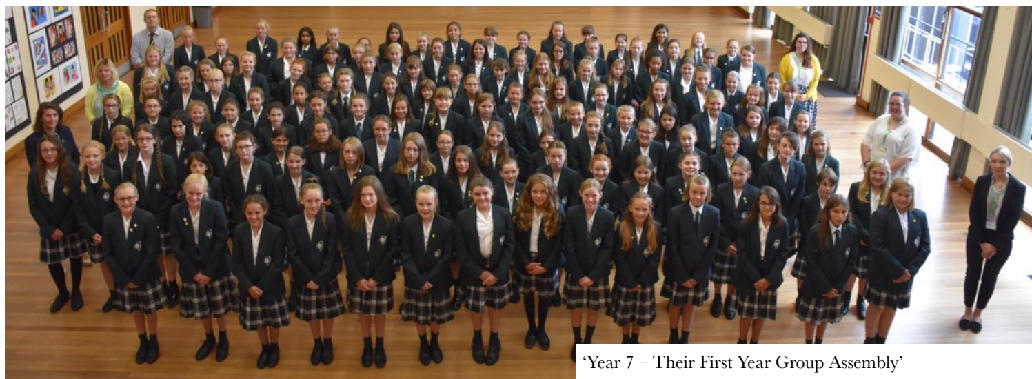
'Year 7 – Their First Year Group Assembly'