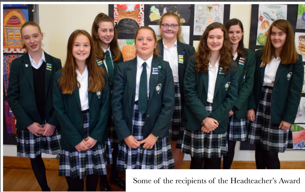
Some of the recipients of the Headteacher's Award

Congratulations to everyone who received an award!