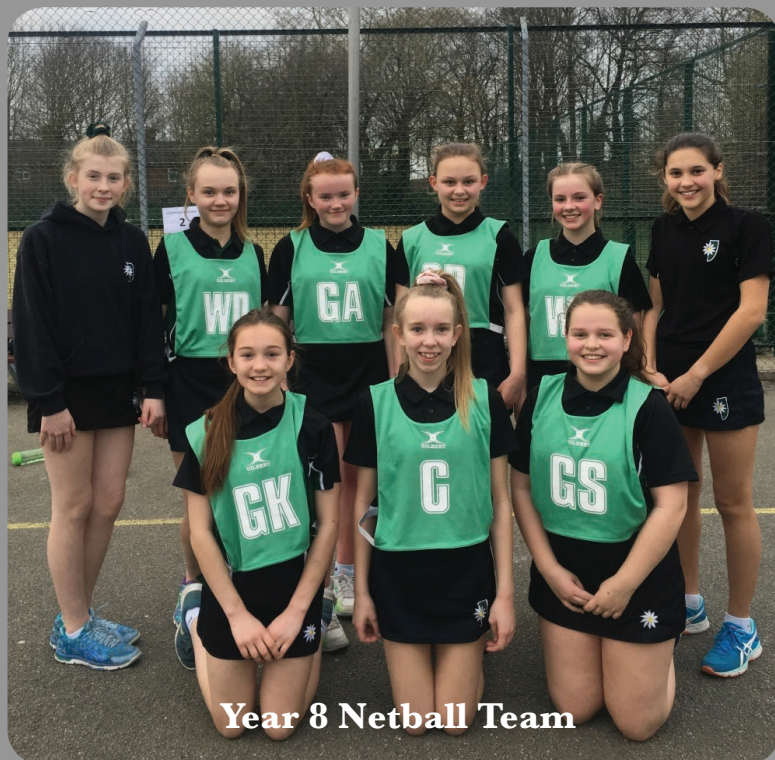
Year 8 Netball Team