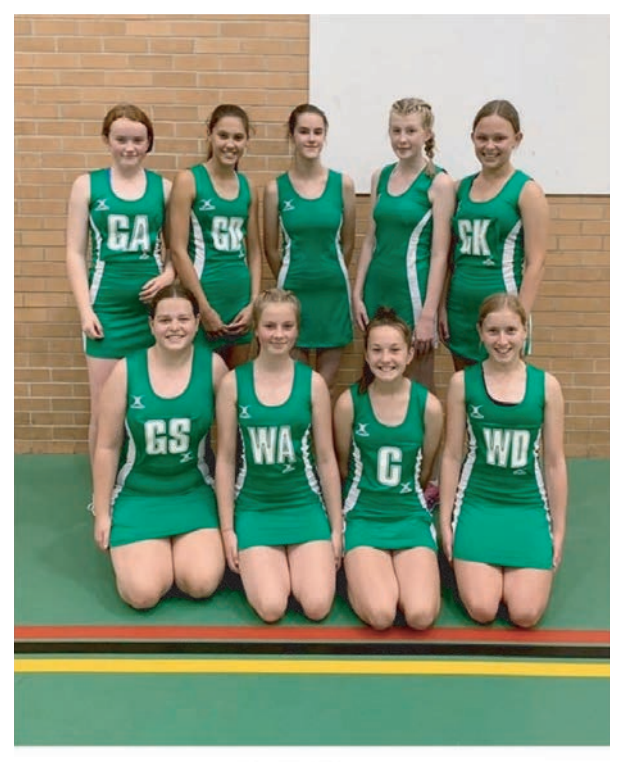
Year 9 Netball Team

LIBRARY OPENING HOURS MON -THURS 9.00-5.00 FRIDAY 9.00-4.30