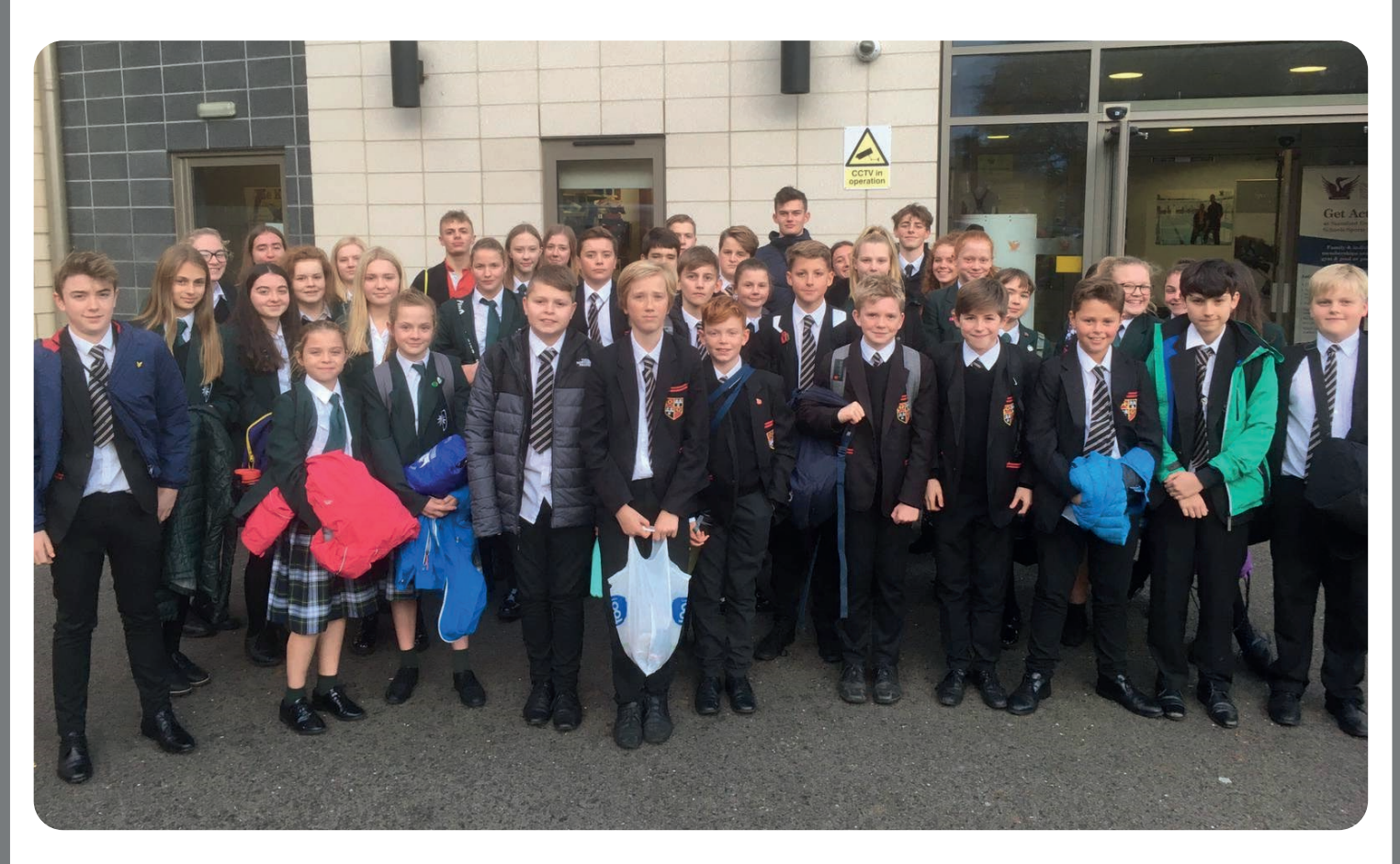
RCT Swimming Team